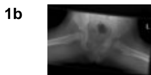
Image 1a and 1b (Plain Radiography): Frontal views in a neutral position and abduction with external rotation. The left hip shows marked fragmentation and resorption of bone and broadening of the femoral head and neck in keeping with advanced Perthes Disease.