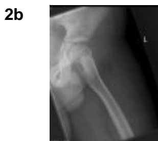
Image 2a and 2b (Plain Radiography): SCFE is demonstrated in the left hip.